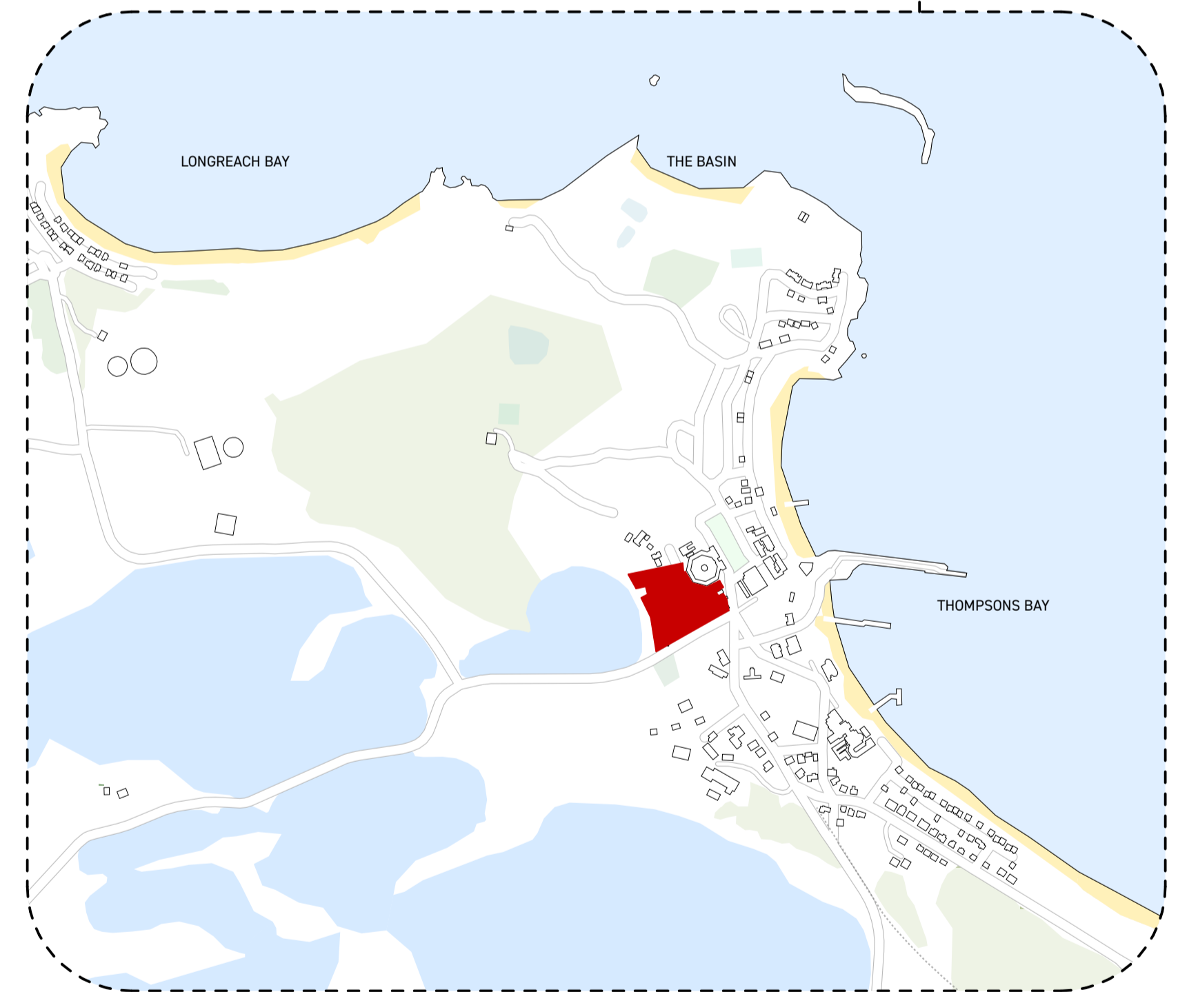
LOCATION PLAN 1:10000