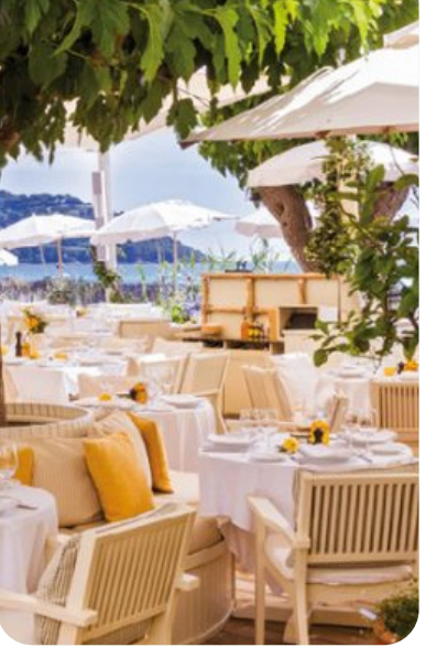
Loulou - St Tropez