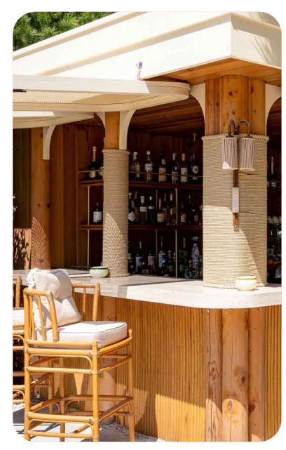
Gigi Rigolatto - St Tropez