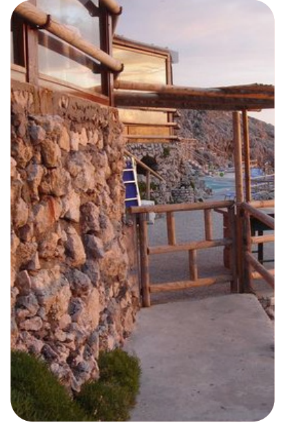
Lido del Faro - Capri