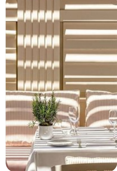
Bagatelle - St Tropez